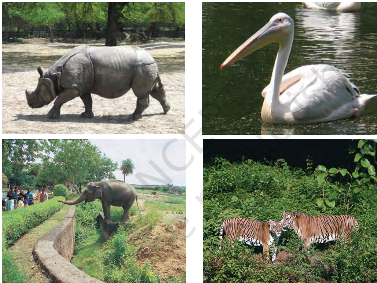
Figure 1.3 Pictures showing animals in different zoological parks of India

These are the places where wild animals are kept in protected environments under human care and which enable us to learn about their food habits and behaviour. All animals in a zoo are provided, as far as possible, the conditions similar to their natural habitats. Children love visiting these parks, commonly called Zoos (Figure 1.3).