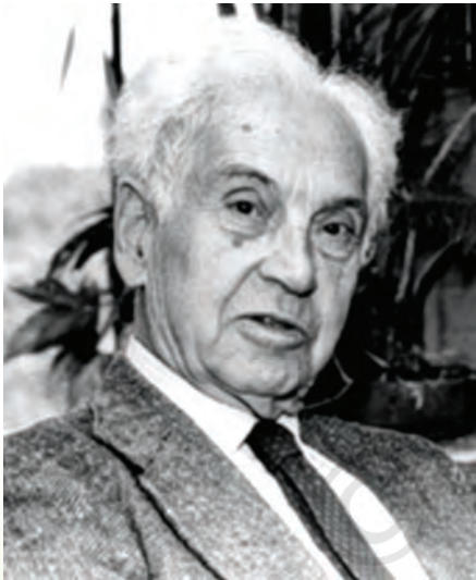
Ernst Mayr (1904 – 2004)

Born on 5 July 1904, in Kempten, Germany, ERNST MAYR, the Harvard University evolutionary biologist who has been called 'The Darwin of the 20 th century', was one of the 100 greatest scientists of all time. Mayr joined Harvard's Faculty of Arts and Sciences in 1953 and retired in 1975, assuming the title Alexander Agassiz Professor of Zoology Emeritus . Throughout his nearly 80-year career, his research spanned ornithology, taxonomy, zoogeography, evolution, systematics, and the history and philosophy of biology. He almost single-handedly made the origin of species diversity the central question of evolutionary biology that it is today. He also pioneered the currently accepted definition of a biological species. Mayr was awarded the three prizes widely regarded as the triple crown of biology: the Balzan Prize in 1983, the International Prize for Biology in 1994, and the Crafoord Prize in 1999. Mayr died at the age of 100 in the year 2004.