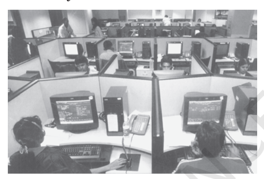
Fig. 3.2 IT industry is seen as a major contributor to India's exports

Some scholars question the usefulness of India being a member of the WTO as a major volume of international trade occurs among the developed nations. They also say that while developed countries file complaints over agricultural subsidies given in their countries, developing countries feel cheated as they are forced to open their markets for developed countries but are not allowed access to the markets of developed countries. What do you think?