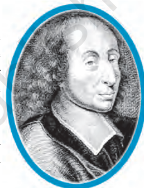
Blaise Pascal (1623-1662)

In earlier classes, we have learnt how to find the squares and cubes of binomials like a + b and a - b . Using them, we could evaluate the numerical values of numbers like (98)^2 = (100 - 2)^2 , (999)^3 = (1000 - 1)^3 , etc. However, for higher powers like (98)^5 , (101)^6 , etc., the calculations become difficult by using repeated multiplication. This difficulty was overcome by a theorem known as binomial theorem. It gives an easier way to expand (a + b)^n , where n is an integer or a rational number. In this Chapter, we study binomial theorem for positive integral indices only.