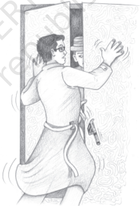
Gerrard gives him a push into the cupboard...

GERRARD : I have got a man posted on the main road. He'll ring up if he sees the