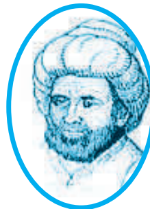
Muhammad ibn Musa al-Khwarizmi (C.E. 780 – 850)

A lemma is a proven statement used for proving another statement.